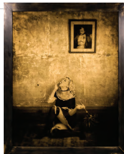
ON THE COVER: OUI, THE PEOPLE (L'ORTOLAN) BY LOUVIERE + VANESSA

"The magical power of images lies in their superficial nature, and the dialect inherent in them – contradiction peculiar to them – must be seen in the light of this magic."